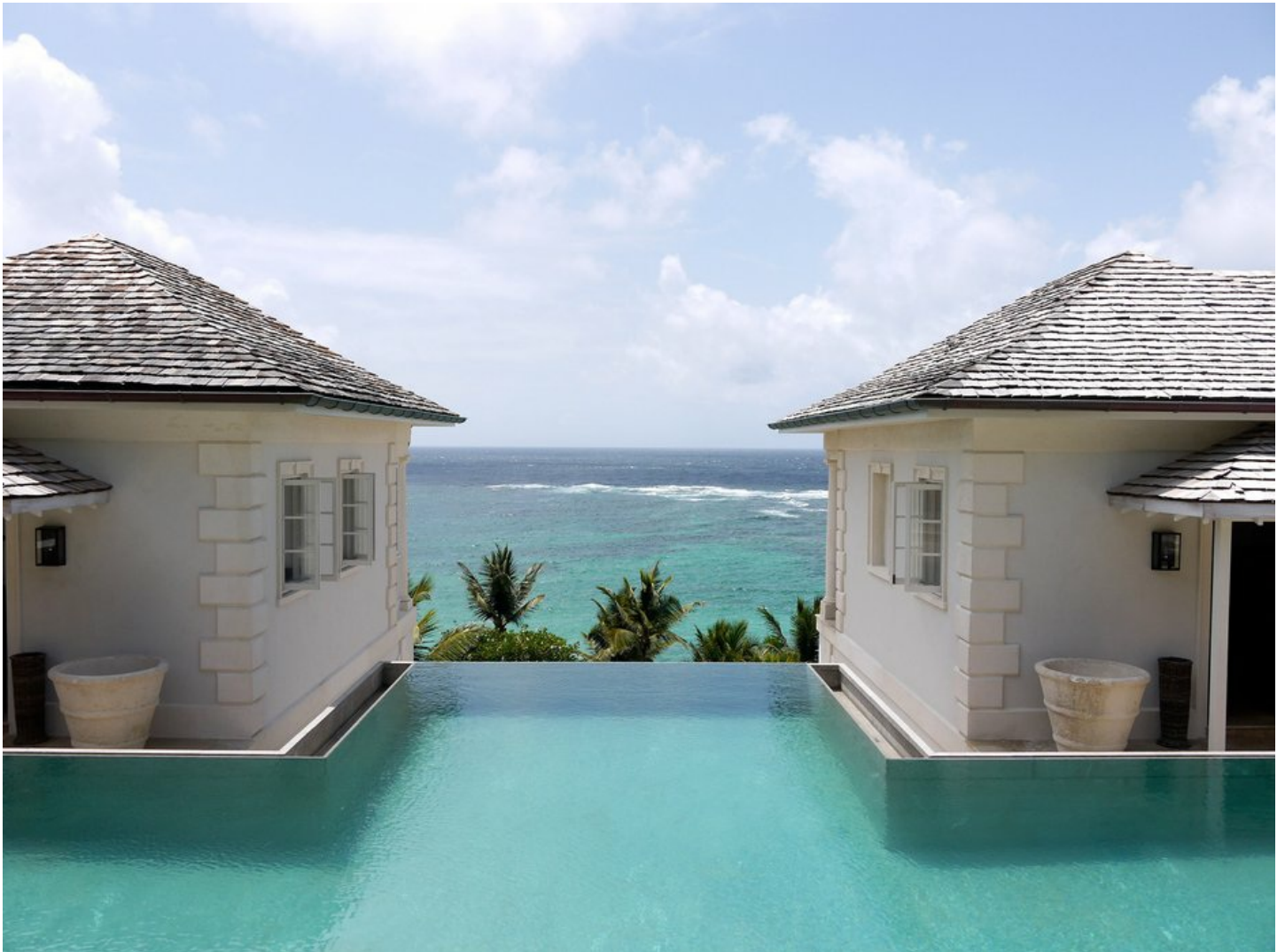
Sunrise Villa in Mustique.